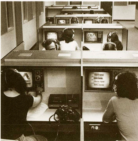
Los Angeles City College, Los Angeles. Student carrels, Pyramid System installation.

The information-handling abilities of the Pyramid System have wide application, as exemplified by the large group instruction room at the Stanford Center for Research and Development in Teaching, School of Education, Stanford University, California. Here a specialized application of the system, incorporating keyboards throughout the lecture room and a computerized readout terminal at the lectern, makes it possible for the instructor to receive an immediate profile of responses to questions or to points made during the lecture, or to record these responses for later analysis.