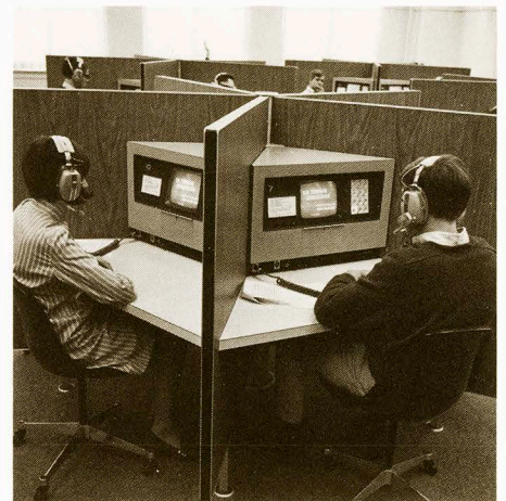
Oak Park and River Forest High School, Oak Park, Illinois.

For additional information concerning the PYRAMID System, contact: