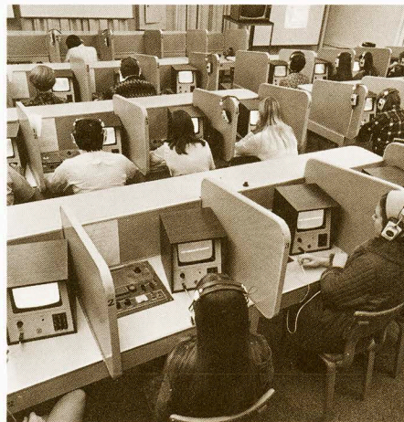
Illinois State University, Normal, Illinois. Student carrels, Pyramid System installation.