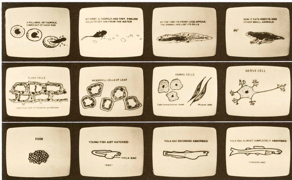
Examples of lesson material presentation on a PYRAMID system, photographed directly from the television screen in a student carrel.

THE CASE FOR AND USE OF PROGRAMMED TEXTS PROGRAMMED INSTRUCTION: BOLD NEW VENTURE Edited by Allen D. Calvin Indiana University Press, 1969